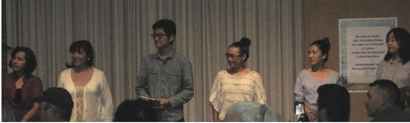
Student Authors featured in the 2018 Writing Collection: Impressions

Held Saturday, September 22, 2018, 4:30 pm – 5:30 pm in the Santa Rosa Central Library Forum Room