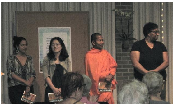
Student Authors featured in the 2018 Writing Collection