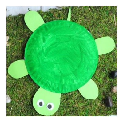
Color a paper plate. Add a head, feet and a tail.